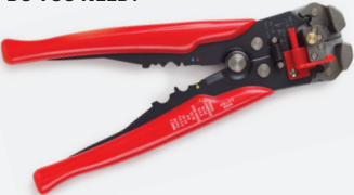
83-6512: GROTE HEAVY DUTY WIRE STRIPPER, CUTTER & CRIMPING TOOL